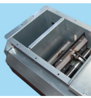
Variable end face for extra cleanliness.