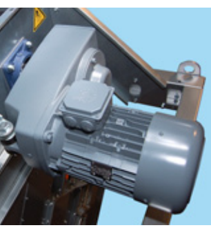
Direct-mounted gearbox motor with support frame.