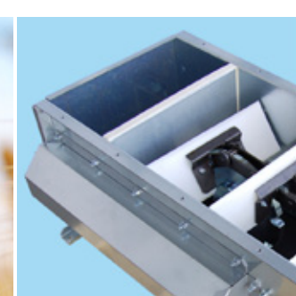
Variable end face for extra cleanliness.