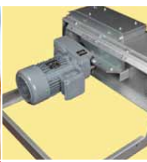
Direct-mounted gearbox motor with support frame.