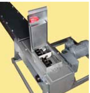
Pop up overloading flap/inspection hatch with safety switch.