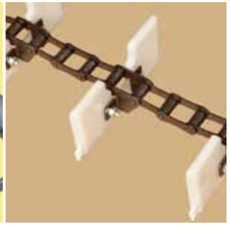
Chain with clean-out flight.

GALVANISED ENERGY EFFICIENT SERVICE FRIENDLY COMPACT RELIABLE EASILY MOUNTED