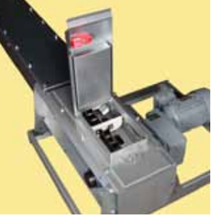
Pop up overloading flap/inspection hatch with safety switch.