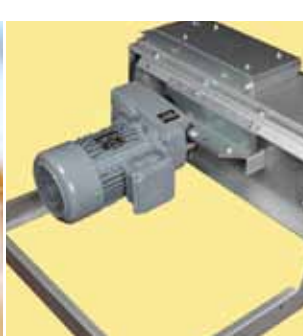
Direct-mounted gearbox motor with support frame.