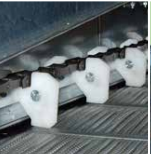
The broom under the machine leaves behind just a small amount of grain.